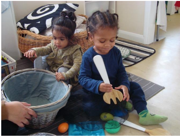
Heuristic Play GH