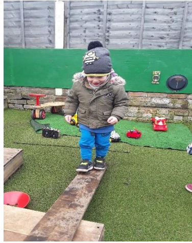
Garden Time SW