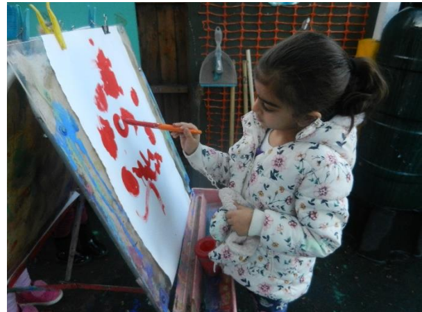
Garden Time GH