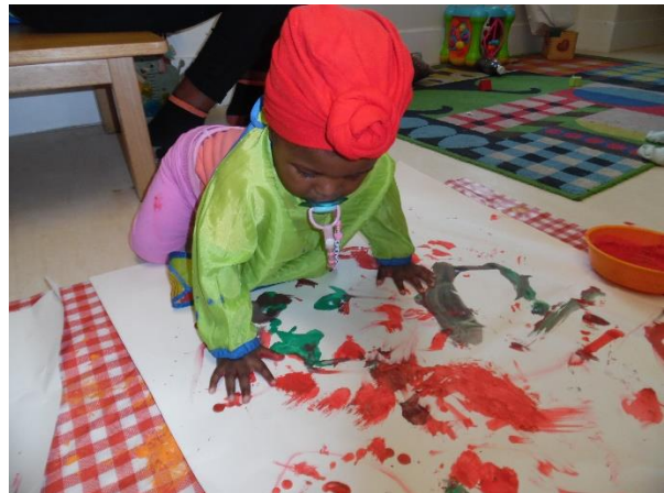
Splat Painting SW