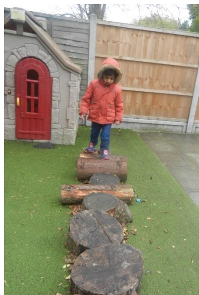
Garden Time GH