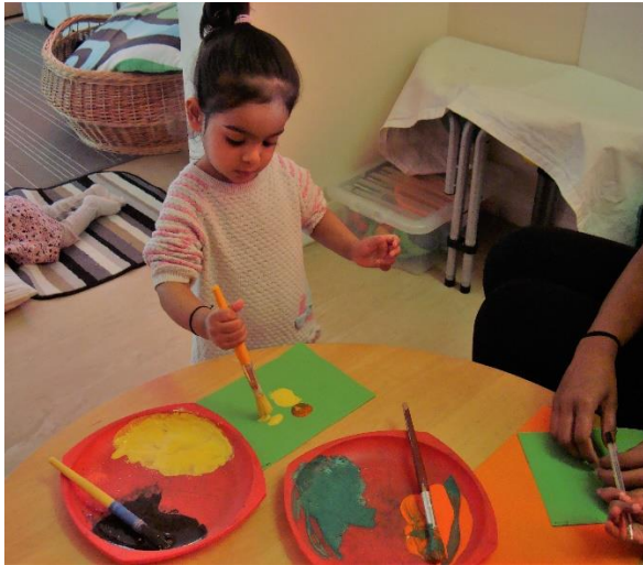
Butterfly printing GH