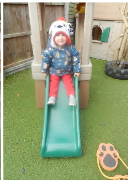
Garden Time GH