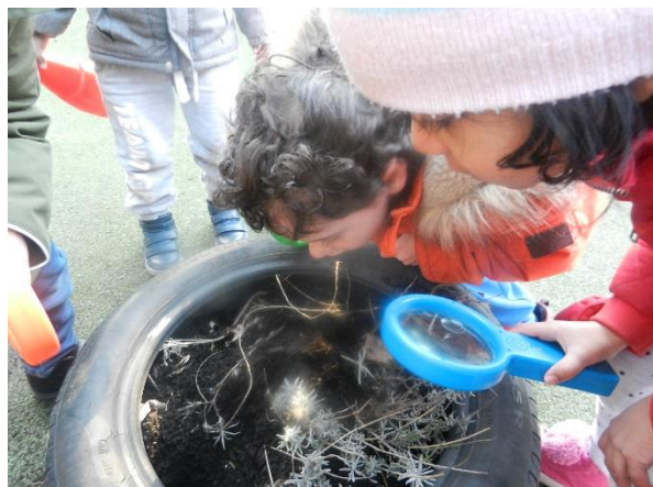
Bug Hunt GH