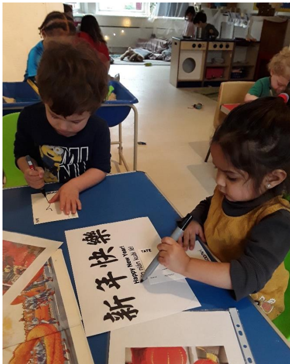
Chinese New Year SW