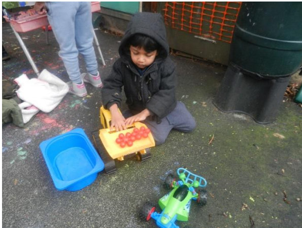
Garden Time GH