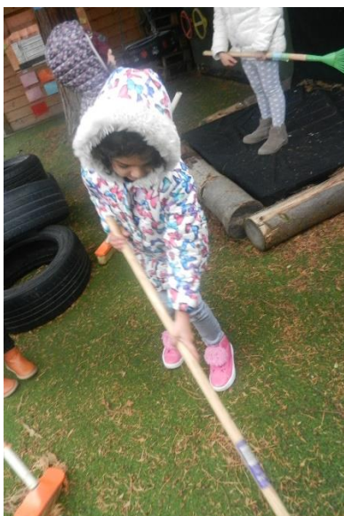
Garden Time GH