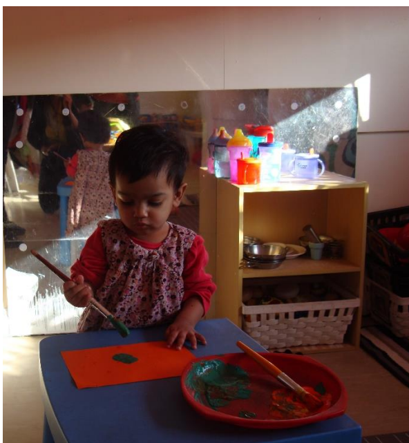
Butterfly printing GH