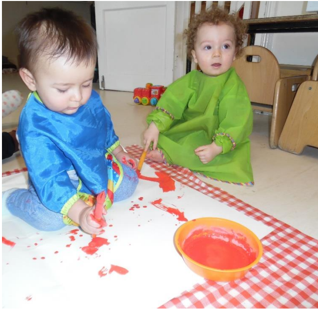
Splat Painting SW