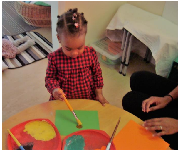
Butterfly printing GH