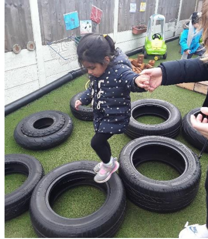
Garden Time SW