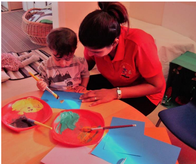
Butterfly printing GH