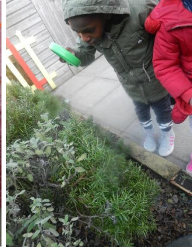
Bug Hunt GH

Rainbow fish Children in South Woodford have been splat painting, exploring different colours and textures. Splat painting is a messy, sensory, playful and creative activity that encourages the development of both fine motor and gross motor skills for the children.