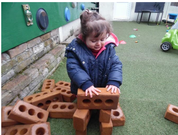
Garden Time SW