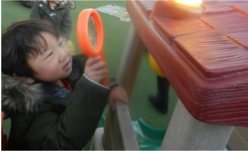
Bug Hunt GH