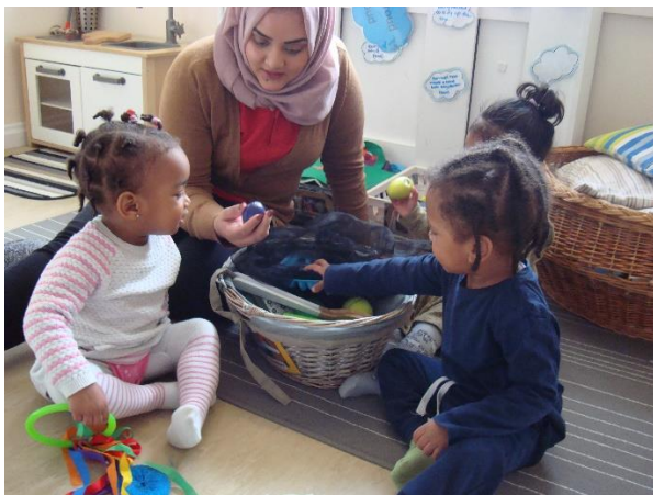
Heuristic Play GH

The younger children at Gants hill have taken part in heuristic play. This activity is where children play with and explore the properties of 'objects'. These 'objects' are things from the real world such as plastic bracelets, cardboard tubes, pegs and tins with lids. Children are able to begin to make their own choices and decisions and start to gain an understanding of the world around them.