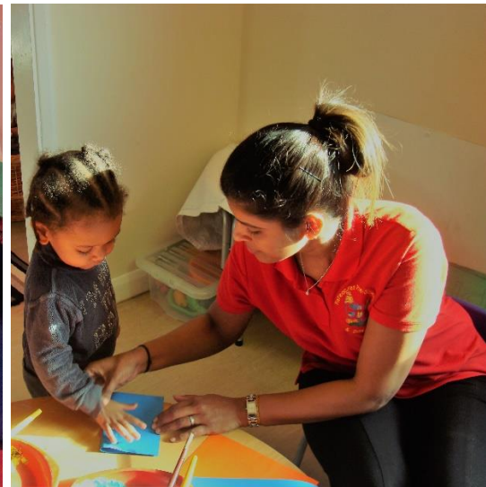
Butterfly printing GH