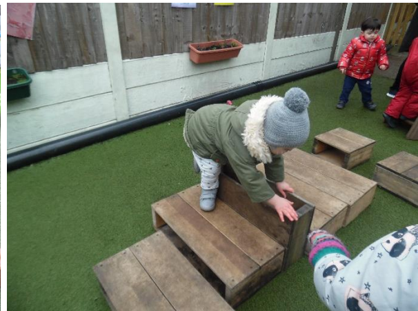
Garden Time SW