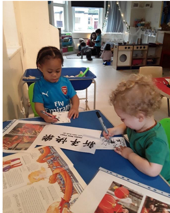
Chinese New Year SW