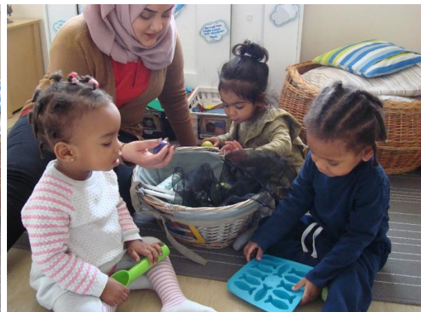
Heuristic Play GH