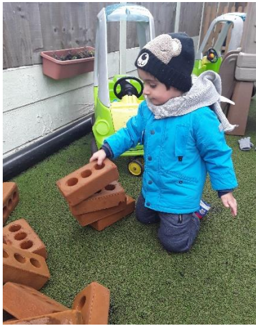
Garden Time SW

love exploring the outdoor environment and despite the current winter weather, we love providing it!