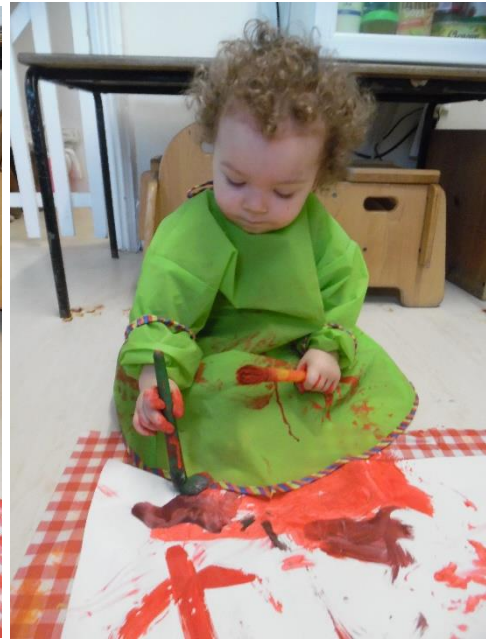
Splat Painting SW

The younger children at Gants hill have taken part in heuristic play. This activity is where children play with and explore the properties of 'objects'. These 'objects' are things from the real world such as plastic bracelets, cardboard tubes, pegs and tins with lids. Children are able to begin to make their own choices and decisions and start to gain an understanding of the world around them.