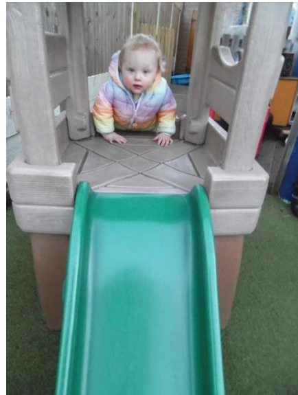
Garden Time SW