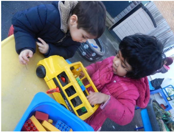
Garden Time GH