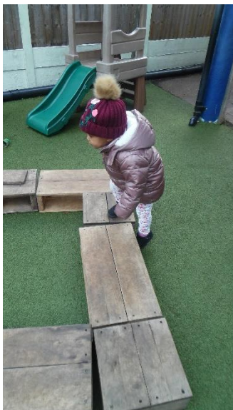
Garden Time SW