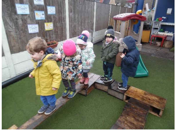
Garden Time SW