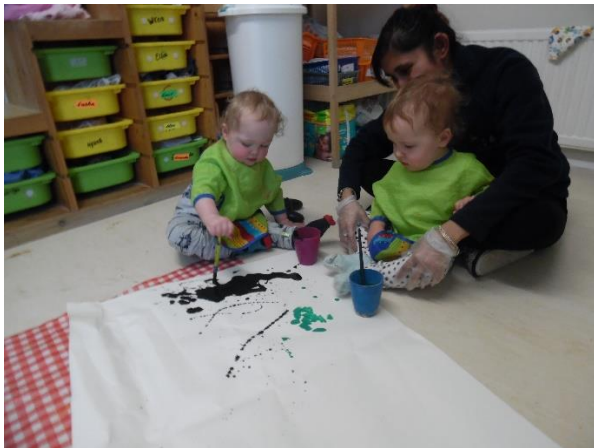
Splat Painting SW

Rainbow fish Children in South Woodford have been splat painting, exploring different colours and textures. Splat painting is a messy, sensory, playful and creative activity that encourages the development of both fine motor and gross motor skills for the children.