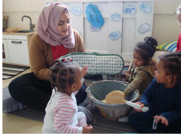
Heuristic Play GH

Stingray children in South Woodford have played with corn flour. There are many benefits to cornflour play. It encourages children to explore texture by themselves, and helps to support the development of fine motor skills. It also supports children's understanding about different consistency by adding more water or more cornflour to the mixture. It offers many communication opportunities and provides children with a calm activity providing relaxation.