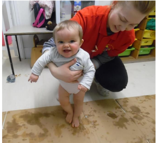
Feet Printing SW