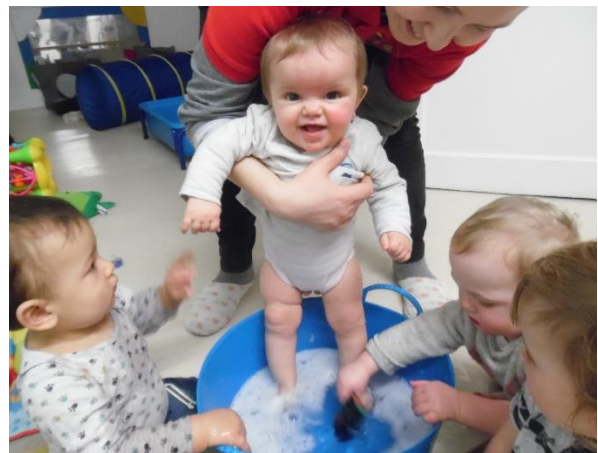
Feet Printing SW