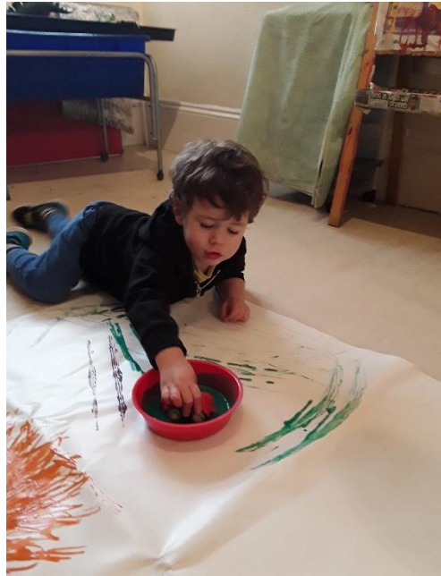
Car Painting SW

The children in Gants Hill have been playing with dance ribbons. These dance ribbons give the children a chance to move freely with and without music. This activity promotes the development of gross motor skills such as twirling, shaking, spinning and waving the ribbon to make spectacular patterns. The movement of the ribbons encourages tracking skills and hand eye coordination leading stimulation to the brain.