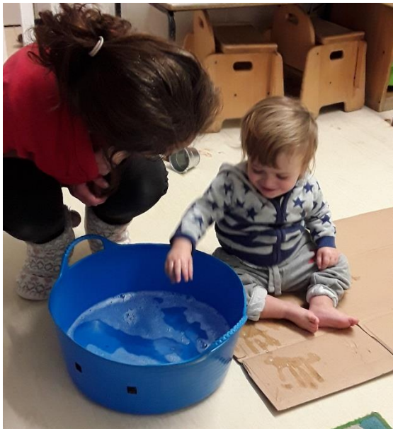
Feet Printing SW