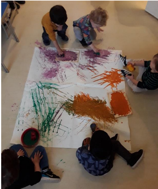
Car Painting SW