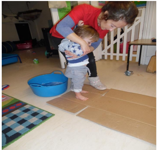
Feet Printing SW