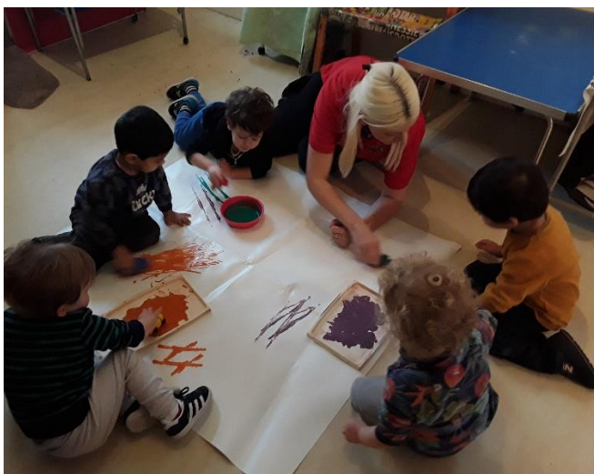
Car Painting SW