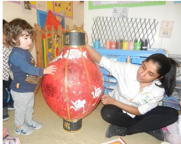
Chinese New Year GH