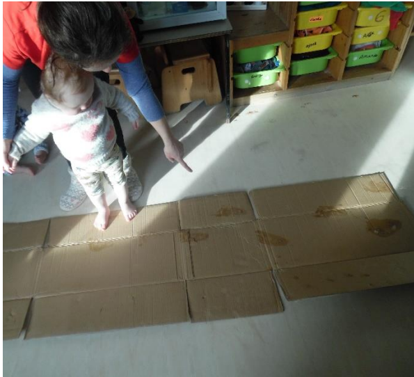
Feet Printing SW