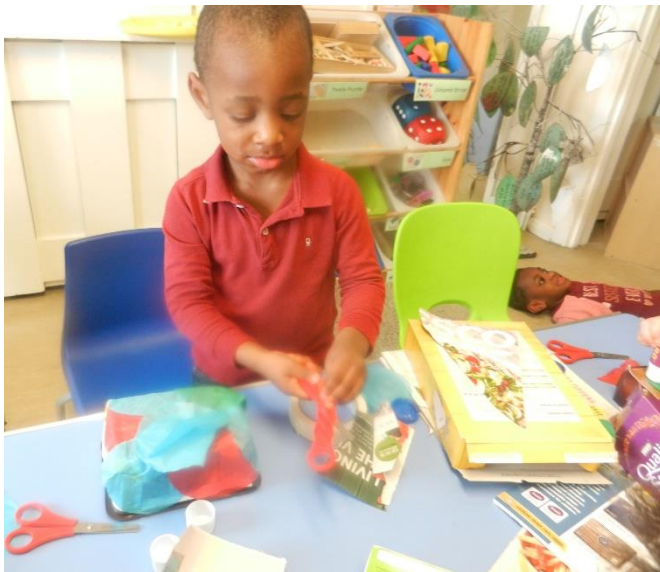
Junk Modelling GH

Stingrays in South Woodford have been playing with the parachute. Parachute play is a great way to promote teamwork amongst children and assisting them to take turns. This activity has helped to build social interaction between peers and staff. With the introduction of music this activity has helped the children to develop a sense of rhythm. Physically parachute play supports the development of the children's upper torso. Here are some comments made by the children: