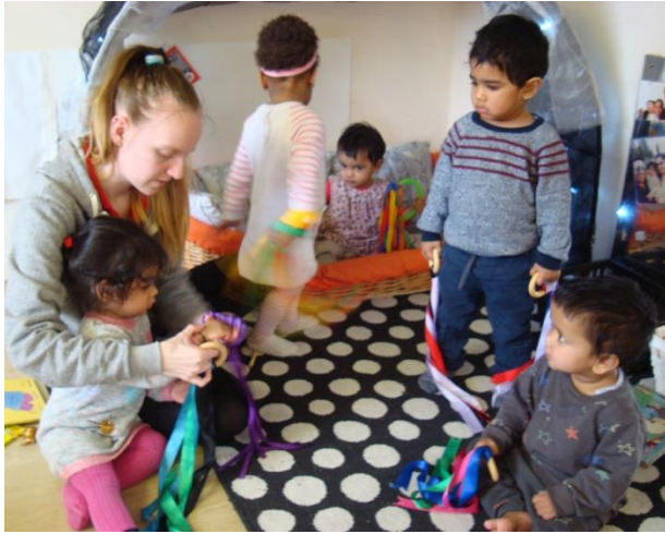
Dance ribbons GH