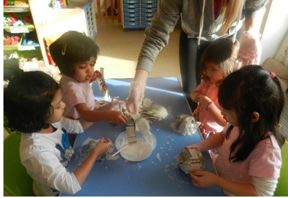
Paper Mache GH