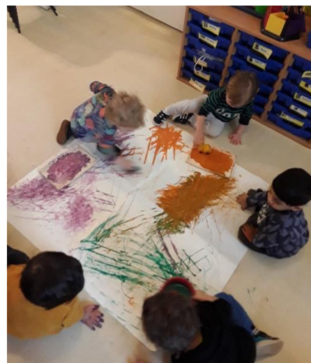
Car Painting SW