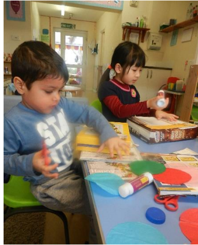
Junk Modelling GH