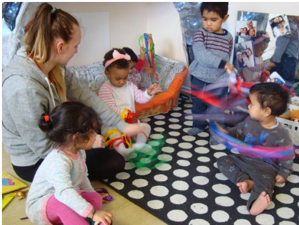
Dance ribbons GH

The children in Gants Hill have been playing with dance ribbons. These dance ribbons give the children a chance to move freely with and without music. This activity promotes the development of gross motor skills such as twirling, shaking, spinning and waving the ribbon to make spectacular patterns. The movement of the ribbons encourages tracking skills and hand eye coordination leading stimulation to the brain.