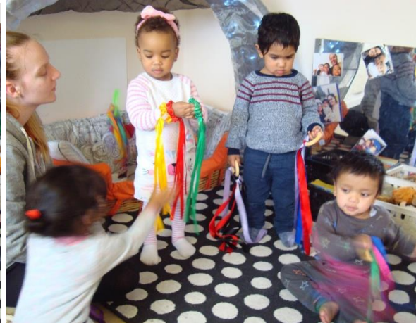
Dance ribbons GH