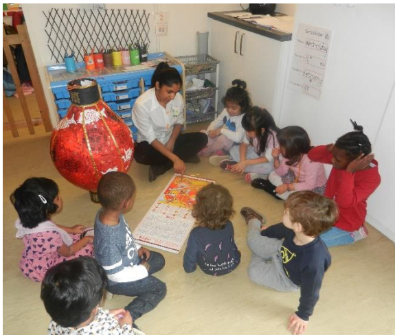
Chinese New Year GH