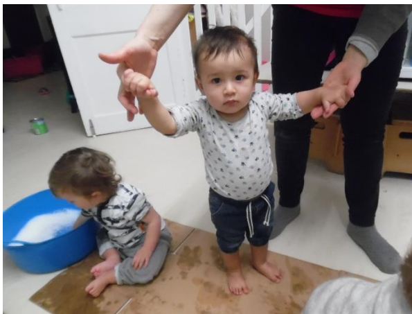
Feet Printing SW