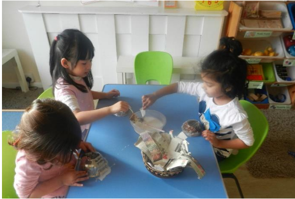
Paper Mache GH

Children in Gants Hill have been learning about Chinese New Year. The children have begun to participate in a paper mache activity where the children have made a lantern. There are many benefits to this activity, the movements used to enhance motor skills such as, tearing the paper, stirring the glue mixture and placing the paper in alternative directions. The nursery has shown the children an example of a paper mache lantern and held circle times to provide the children with more information around Chinese New Year.