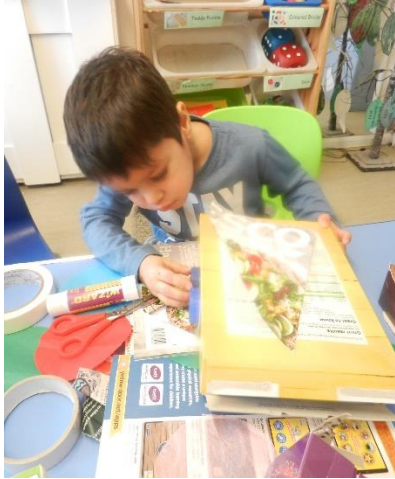
Junk Modelling GH

Children in Gants Hill have been very creative this week by constructing their own models using junk resources. This activity has many developmental benefits starting with the children using their fine motor skills and tools. The children learn about materials, textures, properties and how to manipulate them. The best thing with this activity is the feeling of satisfaction, self-confidence and accomplishment for the children and of course the joy in taking models home to show off.