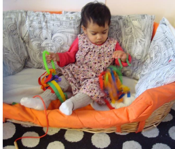
Dance ribbons GH

Starfish in South Woodford have been exploring magnets. As the children attached and removed the magnets from each other. The magnets helped the children to develop their small hand and finger muscles, which are essential for their emerging literacy skills and preparing the children to write. The magnets taught the children “cause and effect” along with problem solving skills that are so essential for developing early brain connections. Here are some of the comments made by the children during their magnet play: