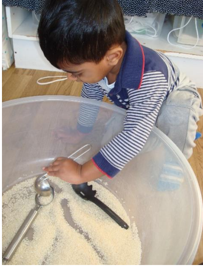
Rice Play GH

The children in Sharks room South Woodford have been exploring raw broccoli. This sensory activity ignites an interest from the children as this is their main method of learning. The children are able to develop their fine motor skills, as manipulating the resources improve dexterity to help with their pre-writing skills. This activity also introduces and promotes healthy eating with the children.