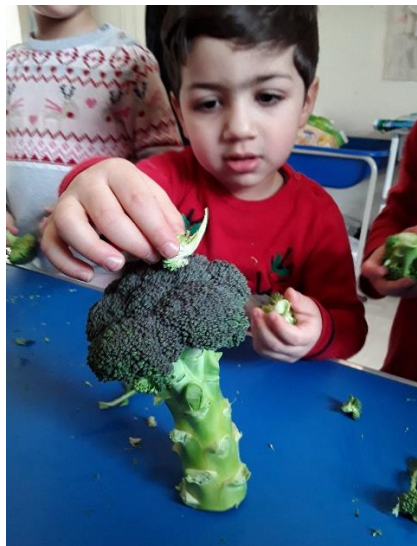
Exploring Broccoli SW

The children at Gants Hill the children have been exploring colour by participating in large scale painting in the garden. There were many benefits to this activity.