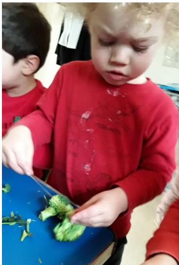
Exploring Broccoli SW