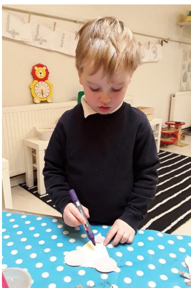
Making Mice SW