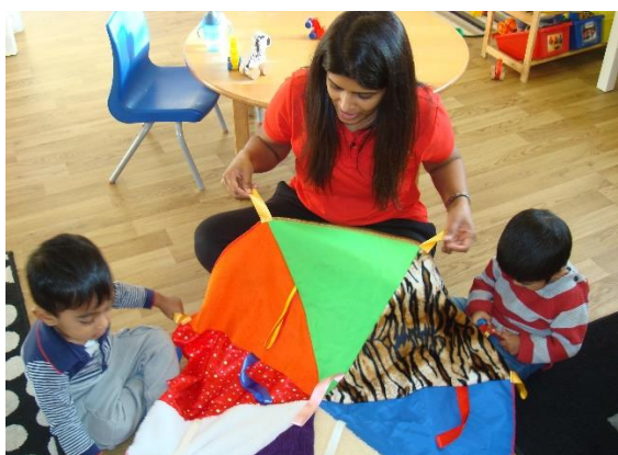
Sensory Parachute GH

The children at Gants Hill the children have been playing with the sensory parachute. This activity promotes so many areas of learning whilst the children are having so much fun. This form of play encourages a variety of different skills. By coordinating the parachute together, children learn about cooperative play and communication, along with taking turns and learning to follow instructions. Repetitive motion and using songs helps with developing a sense of rhythm, which in turn can help with cognitive process.