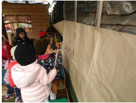
Large Scale Painting GH

The children in Starfish room South Woodford have been making paper mice using a combination of glue, scissors, felt pens and glitter to achieve the desired effect. The children were given the materials to create their own mice. At first sight this looks like a lovely craft activity, but the learning opportunities are plentiful and range from 'Personal, Social and Emotional' to 'Physical' development.