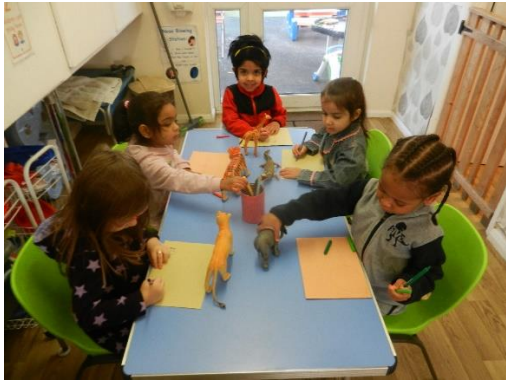
Observational Drawing GH