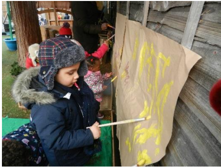
Large Scale Painting GH

The children used scientific thinking to observe, predict and compare, and they experimented with cause and effect. 'What will happen if we mix all three colours together?' From this the children used problem solving skills and came up with ideas for what to do when the colour they were mixing didn't turn out quite the way they had hoped. Along with the developing the children's fine motor skills.