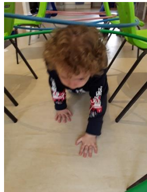
Obstacle Course SW