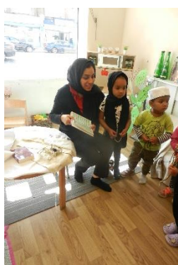
Celebrating Eid GH

The children in Starfish room South Woodford have been budding carpenters this week and have used sand paper to prepare their wood, ready for painting. The children were using this technique for the first time and they were exploring how to get the best effect. Once sanded, they painted their wood and displayed this in the room for all to see. Practitioners gave clear instructions for the children to follow which helps develop their communication and language skills, in particular the aspect of understanding.