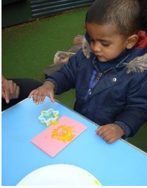
Eid Cards SW

The children in Sharks room South Woodford have created an obstacle course and have used chairs and hula hoops to create a tunnel. The children all took turns to crawl through the tunnel and used their gross motor skills to get to the other side successfully. The children were all very excited to participate and this meant that the fact they were taking turns was challenging. This type of activity, with the help of practitioners, will develop the turn taking skill, which is so important for personal, social and emotional development.