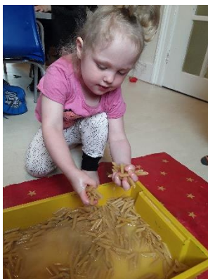
Pasta Play SW