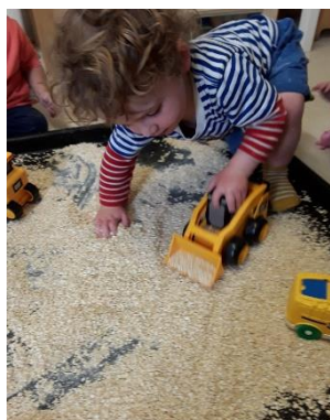
Oat Play SW

The children at Gants Hill the children have been using a clever experiment to observe what happens when colours mix. They used bicarbonate soda and food colouring in water to see what would happen. This is a lovely activity which clearly display to children the mixing of colours and help them understand the primary and secondary colours.