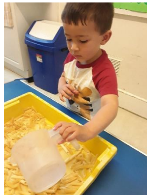
Pasta Play SW

The children at Gants Hill the children have been making cards for Eid. Celebrating different festivals help the children to understand the importance of bonding together, sharing joys and celebrating happiness with togetherness. The children have decorated their cards using a range of materials and resources. There are many benefits to this activity; it helps develop fine motor skills plus it's a great for hand-eye coordination. It's open-ended so even the youngest children can express their creativity.