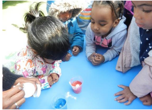
Colour Experiment GH

The children in Stingrays room South Woodford have been exploring the difference in texture that pasta has when water is added. The children added both cold and warm water at different times, which in turn meant that they experienced the texture of the pasta when hard, and how it softens with the addition of water. These activities are fantastic for language development, as there are so many cues for conversation and for the use of a specific vocabulary. The practitioners ensure that the children participating are having their individual needs met and challenged.