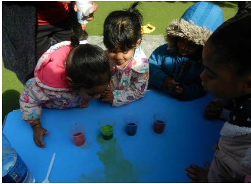
Colour Experiment GH