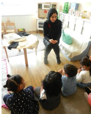
Celebrating Eid GH