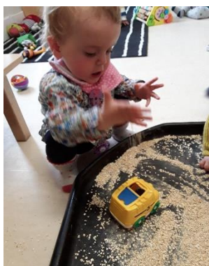
Oat Play SW