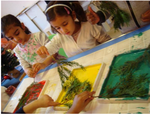
Painting with Leaves