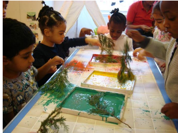
Painting with Leaves